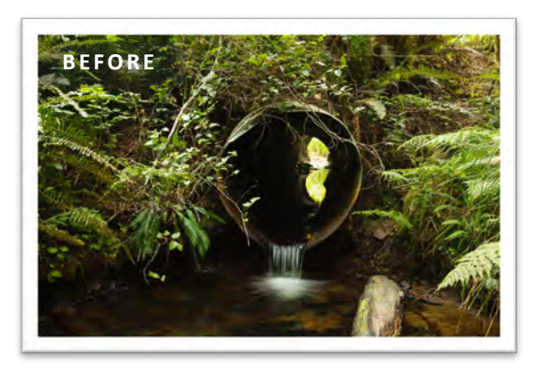
BEFORE: The culvert at Rover Creek was undersized, in very poor condition, and at risk for failure.

The undersized culvert was removed and replaced with a 20' clear span pre-cast concrete modular bridge, restoring 0.75 miles of upstream spawning and rearing habitat. Surrounding logs and rootwads that were removed during construction were placed downstream of the project area for stream bank protection and habitat enhancement. The streambed was reconstructed using streambed simulation methodology. This technique emulates the stream's natural bedform, including gravels and boulders, to create optimal fish habitat and passage.